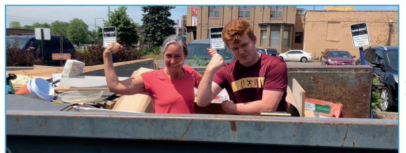
Shedding the weight of 2020 by clearing out our offices.